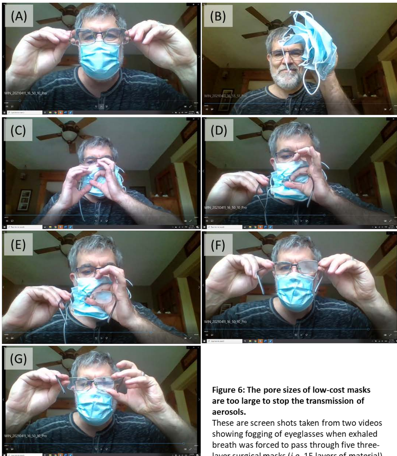
Figure 6: The pore sizes of low-cost masks are too large to stop the transmission of aerosols.

These are screen shots taken from two videos showing fogging of eyeglasses when exhaled breath was forced to pass through five three-layer surgical masks ( i.e. 15 layers of material).