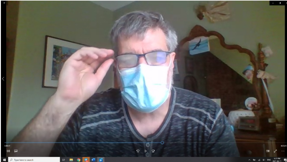
Figure 4: The leakiness of low-cost masks.

These are screen shots taken from a video showing fogging of eyeglasses when wearing a three-layer surgical mask. (A) While inhaling, the metal bar over the nose is pinched to maximize the 'seal'. (B) During exhalation aerosol exiting the lungs is condensing on the lenses of the glasses, causing them to fog.